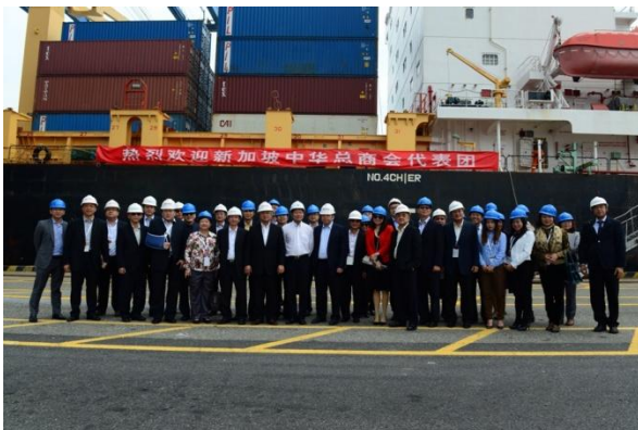
Visit to Nansha Port Phase 2 (考察南沙港二期)