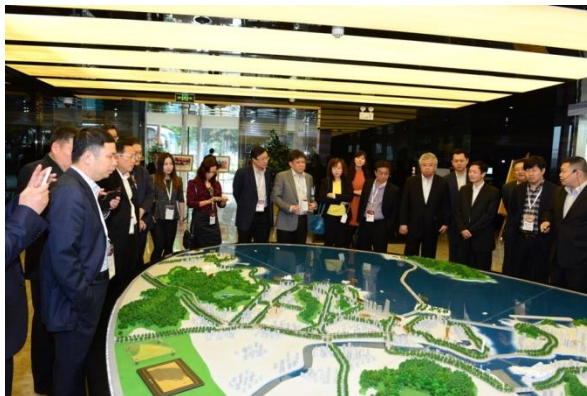
Briefing of the Yanlord project in Binhai Centre, Zhuhai (参观仁恒滨海中心)